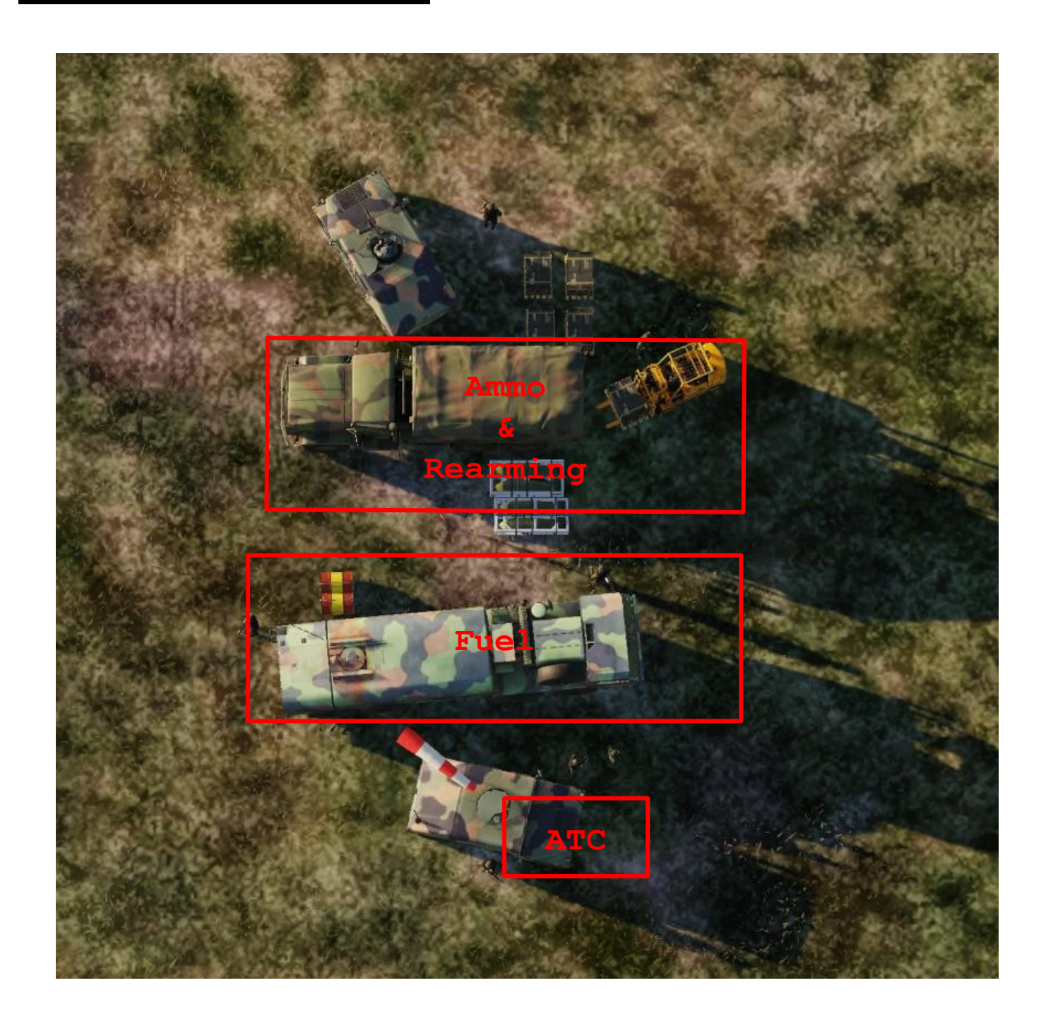
FARP_MINIMUM_ROADSIDE_X Size 20m x 14m

Small mobile FARP with support vehicles and a single armed HMMVV.