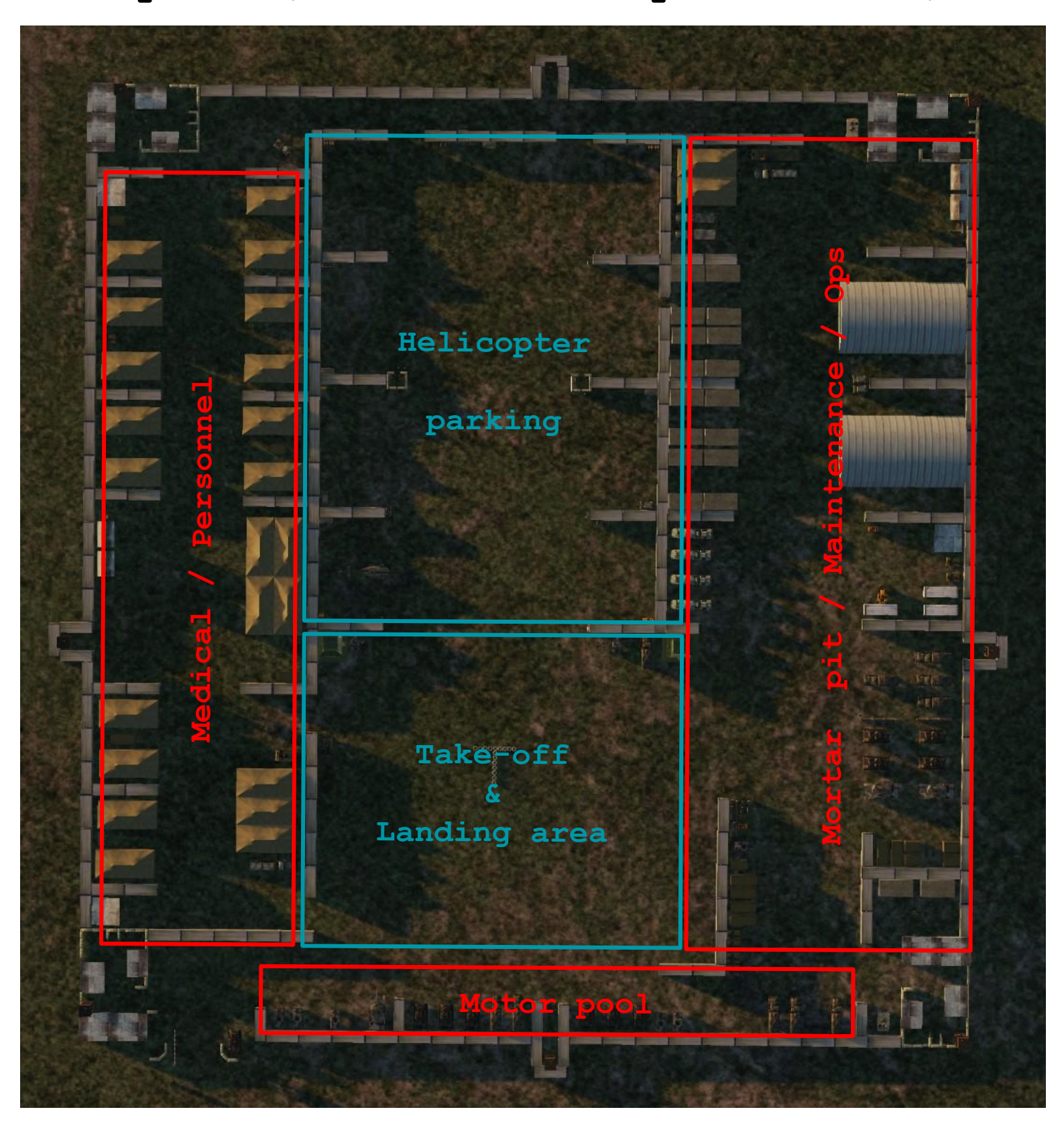
FOB_8_SPWN Size 250m x 235m FOB with 8 Helicopter slots, invulnerable perimeter defense, medical facility, small motor pool and mortar pit.