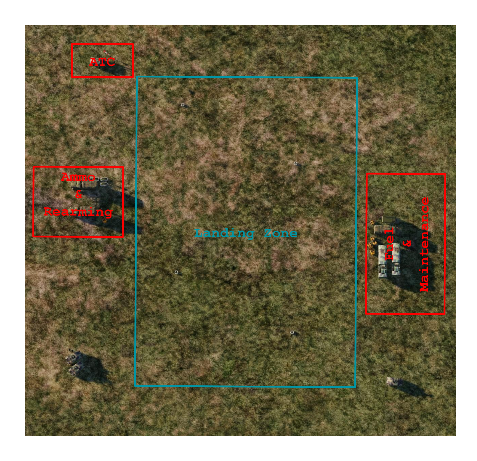
FARP_MOBILE_ROADSIDE_x Size 100m x 100m

Medium sized roadside FARP with place for 4 helicopters to land.